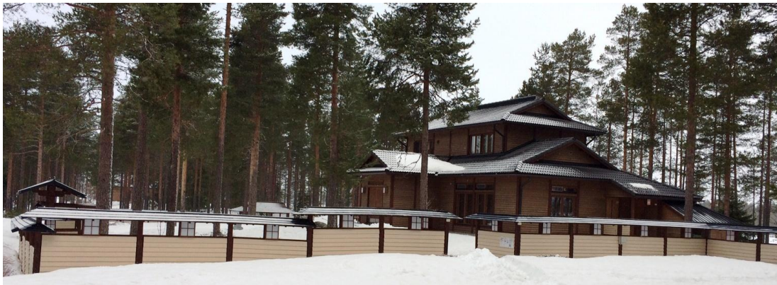
<Japanitalo, in Ranua>

On Monday 14 th September, H.E. Ambassador Kenji Shinoda will make an official visit to Japanitalo, in Ranua.